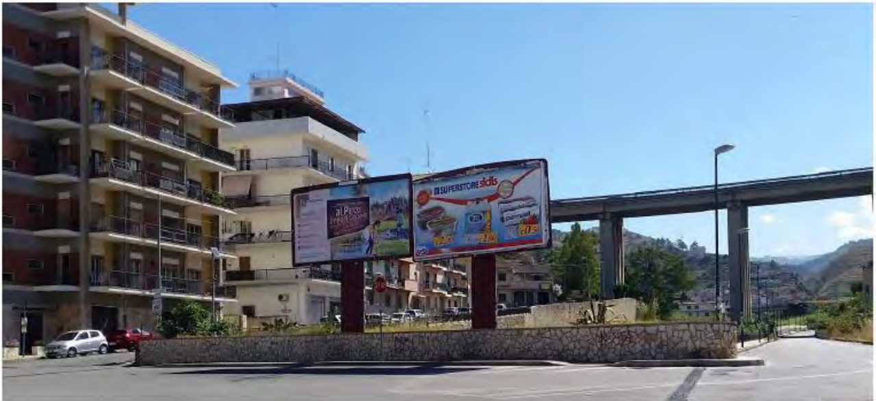
Bus Stop “S. Brunello”

Here you can see an overview how to get from the bus stop “ S. Brunello ” to the school venue.